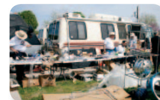
Vendors and Flea Market