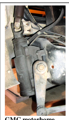
GMC motorhome steering box

The power steering box used in the GMC motorhomes was built by Saginaw and was used on most General Motors vehicles in the decades of the 60's, 70's and 80's as well as some Ford and Chrysler vehicles.