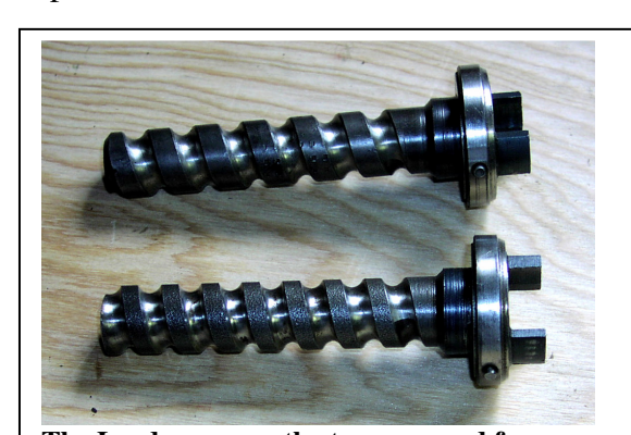
The Lead screw on the top was used for quick turning muscle cars. The 7/16" pitch lead screw on the bottom is what is used on trucks and GMC motorhomes.

Metric components started in 1984. While these late model steering boxes will bolt into the chassis, you need to change the way the power steering fluid connections are made. Adapters to convert the metric fluid connection lines to earlier standard fittings are available. The newer boxes use an o-ringed metric end while the older boxes use the common 3/8" flare end. NAPA sells the required adapters. They are: