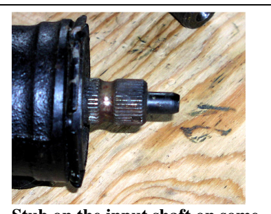
Stub on the input shaft on some truck boxes. Just cut it off.

All trucks 1/2-3/4-1&1-1/2 ton GMCs also several Dodge and a few Ford trucks. All full size GM cars.