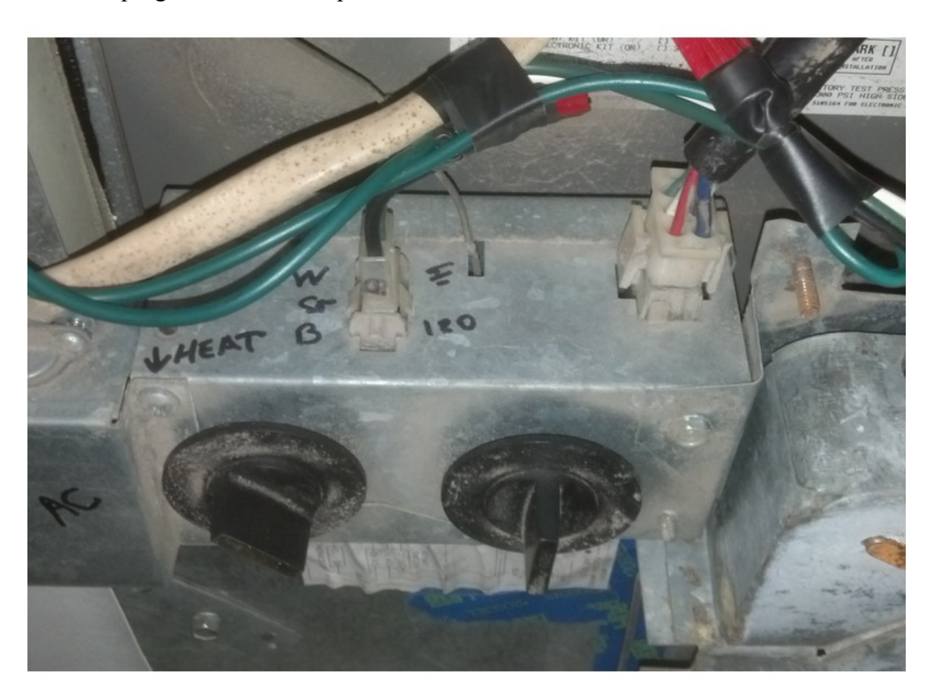
(take the opportunity to vacuum out the unit... ②)

Basically all you need to do find your hot leg, normally the black wire, and decide where you want to cut it. On our BriskAire II, once the cover is removed, this is what the plug for our heat strip looks like: