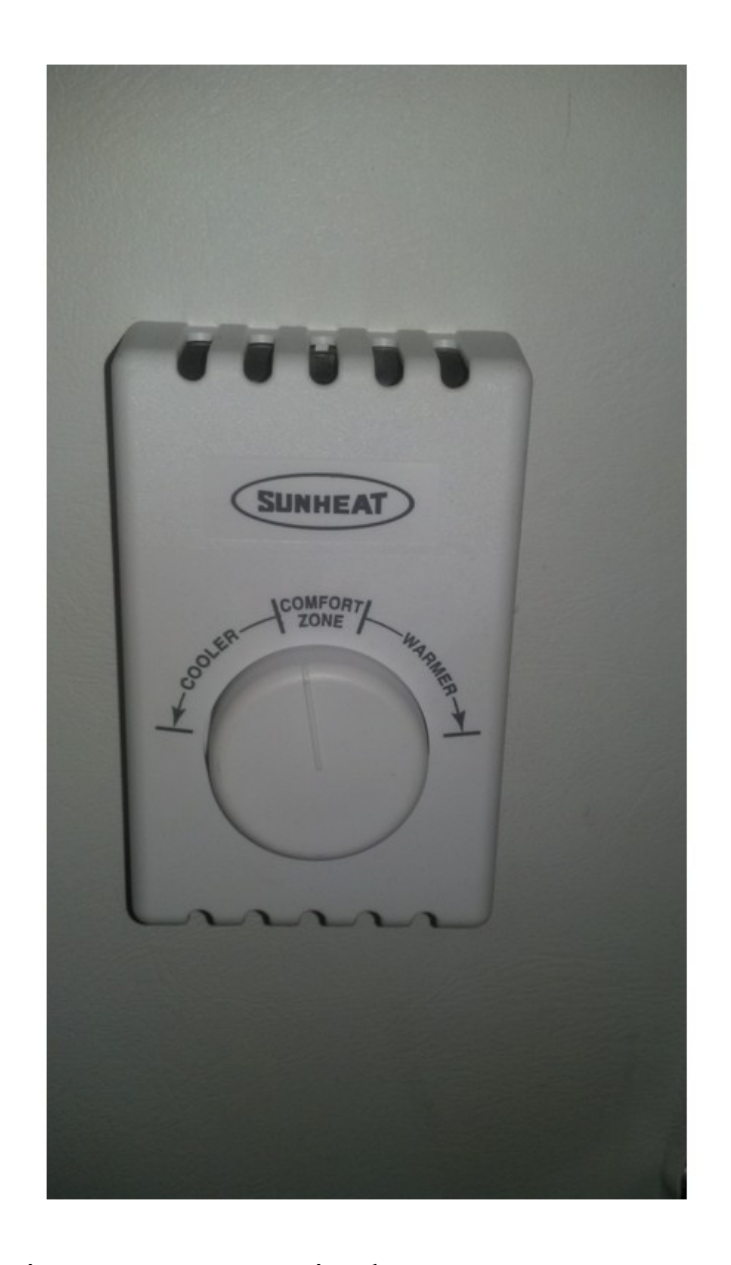
That's it. You can mount it wherever you want. Best 20 bucks you'll ever spend.