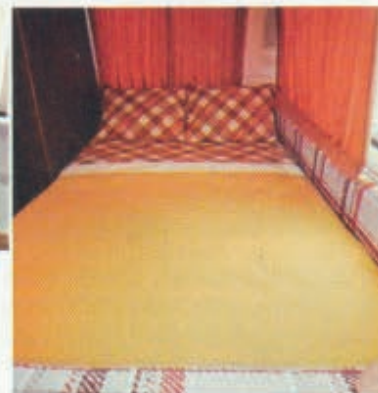
Crestmont Interior by Midas International, Elkhart, Indiana.