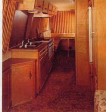
Avion interior design puts every foot of space to work. Note efficient arrangement of galley and dinette.

Avion interiors include top-name appliances, bedding and appointments, plus luxurious, deep-nap carpeting and coordinated upholstery. The plan and photos at right will tell you a lot. A close, personal inspection will tell you there is no finer motor home interior.