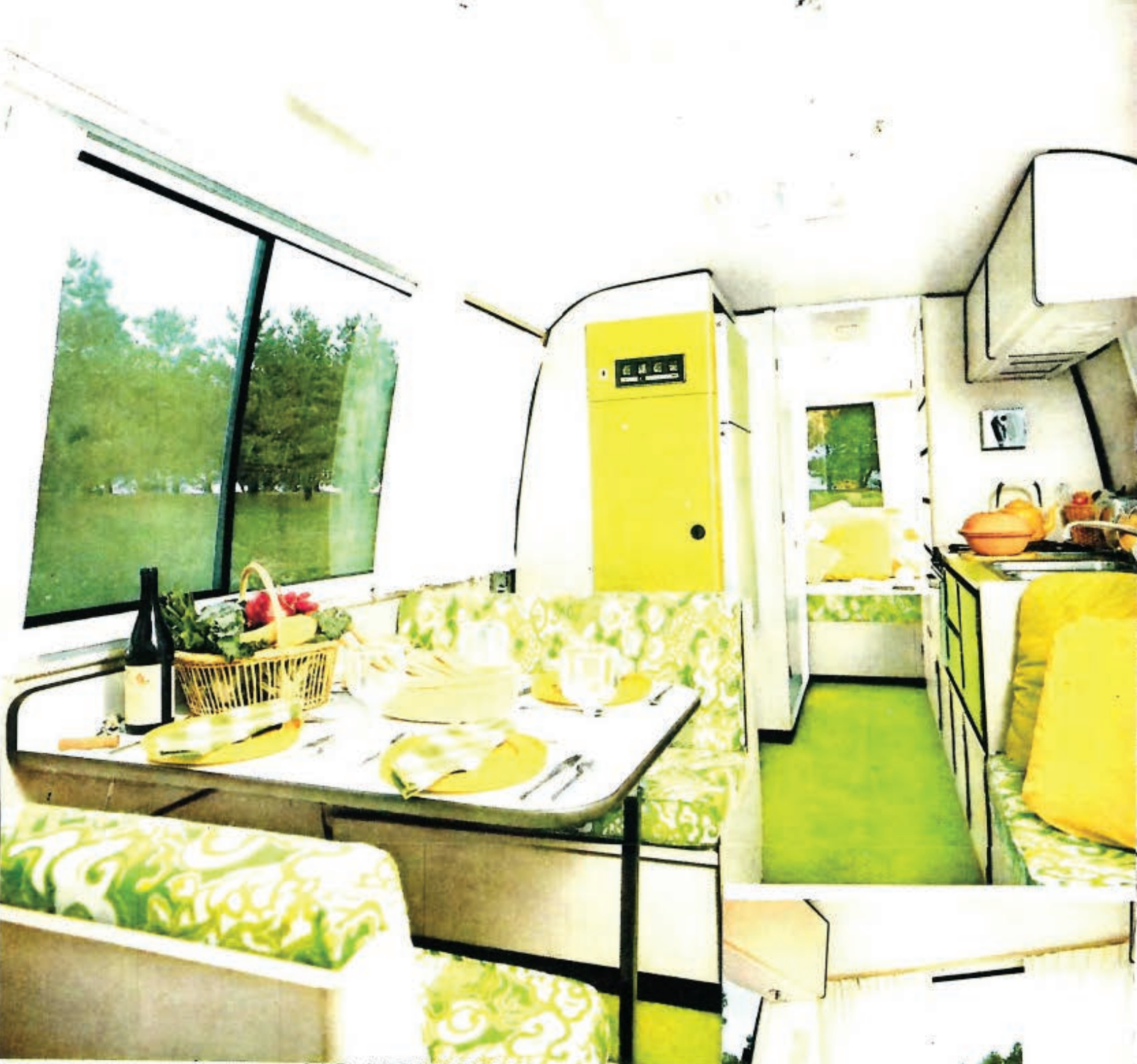
IN THE GETAWAY-MOBILE NO-NONSENSE MATERIALS IN HOUSE & GARDEN COLORS