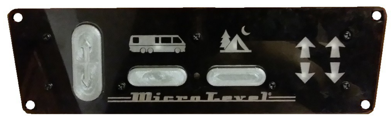
Black / Silver buttons