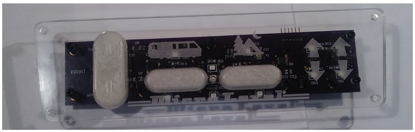
Clear / translucent buttons

Valve Block ( not actual valves supplied )