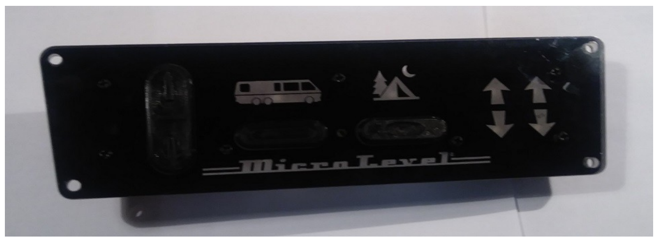
Black / Black Buttons